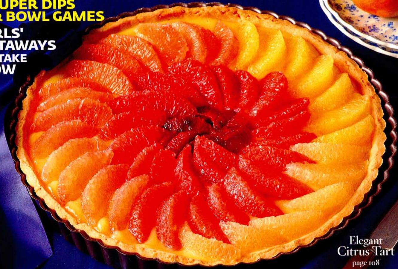
Elegant Citrus Tart page 108