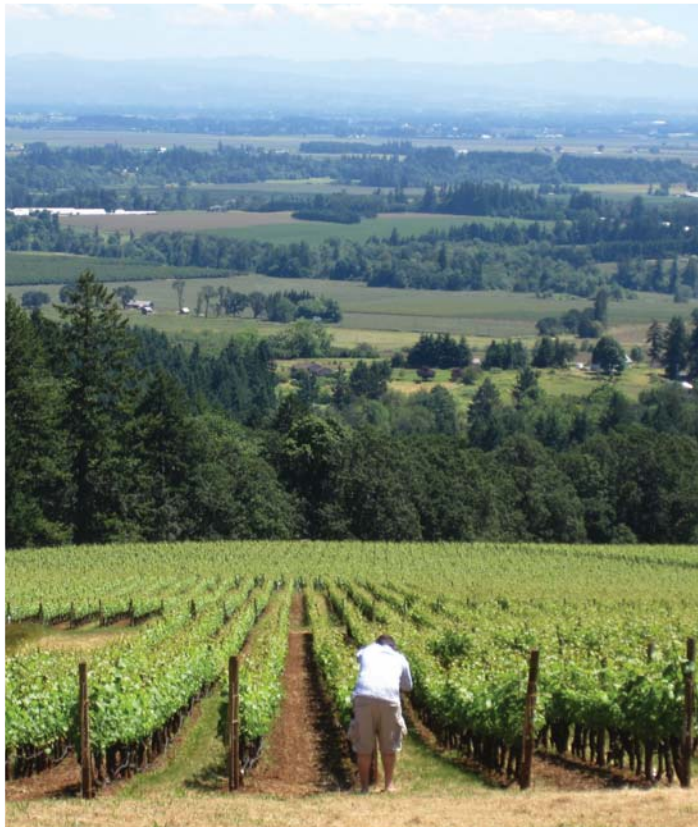
Scenes of wine camp: From fields of grapes to the finished product.