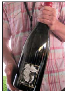
Big bottle, pretty label